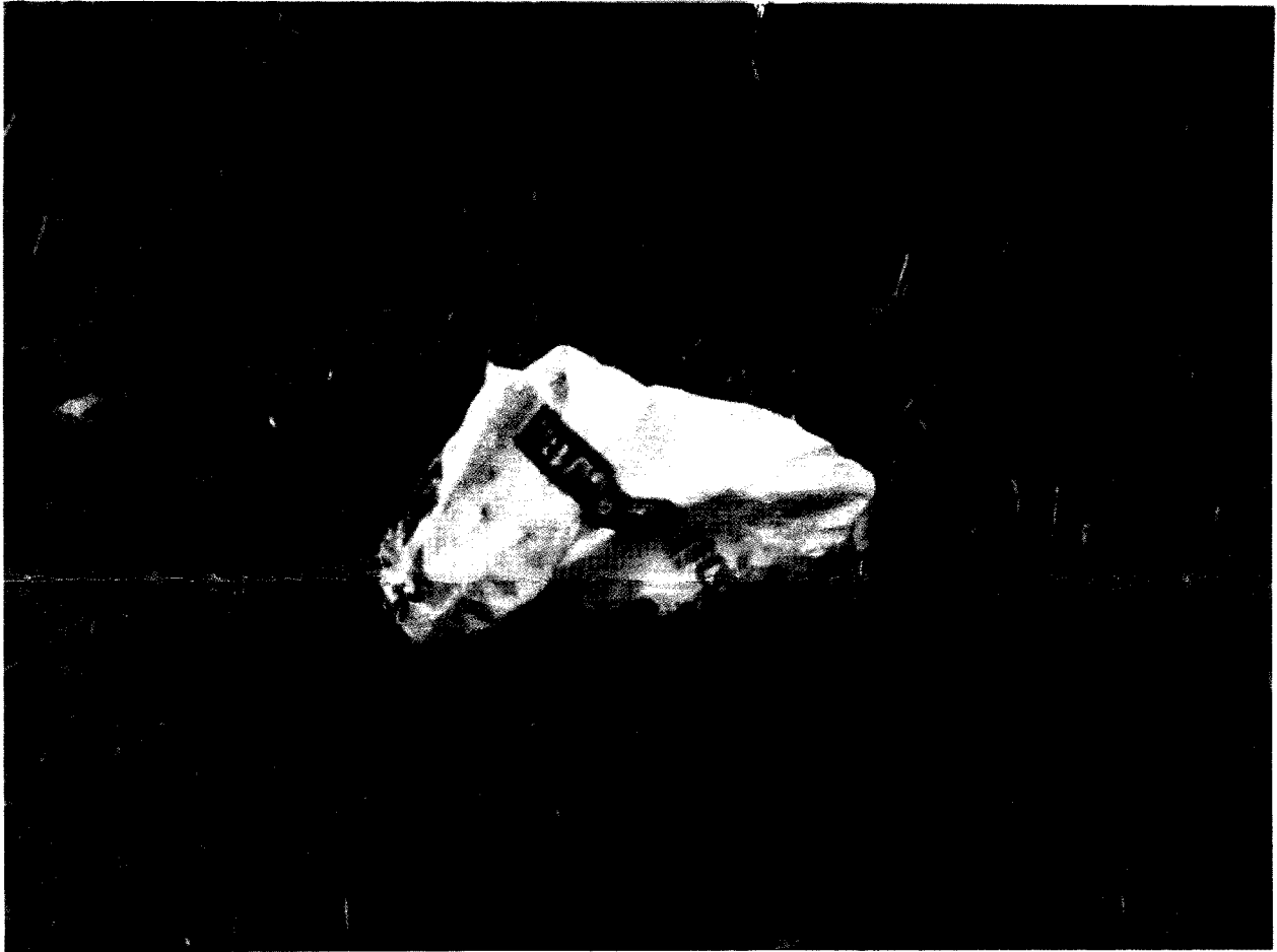
11/09/09- Complaint # 09-197 Picture taken on Budd Rd. (south side of Budd Rd. near W. Highpoint) Picture of a paper bag on top of soil. EC